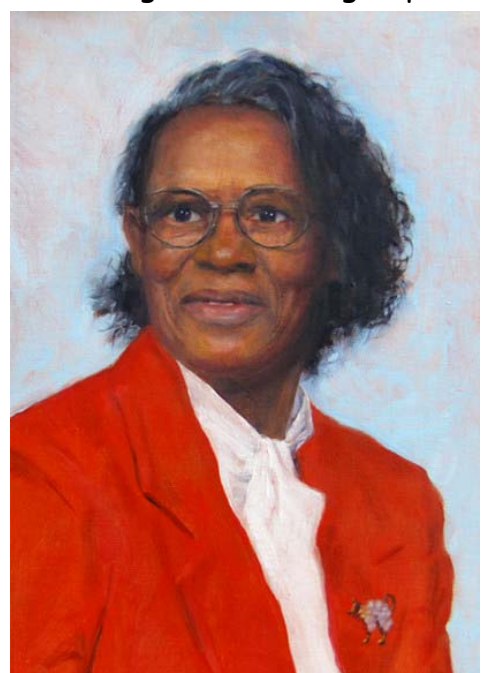
The Matriarch (left)

My approach to painting is to capture the grace and beauty of ordinary people. The sampling of portraits and figuratives included on this website were painted from life in my studio and at the Art Students League in New York. My quest is not to capture a moment in time, but to capture a time in the life of the individual I paint. In so doing, I hope to evoke a response and create an emotional connection between the painting and the viewer, which to me is a rewarding and humbling experience."